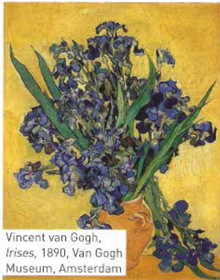
Vincent van Gogh, Iris , 1890, Van Gogh Museum, Amsterdam

they had many famous exhibitions. At the van Gogh exhibition on 4 th November 1935, there were sixty-six oil paintings, fifty drawings and