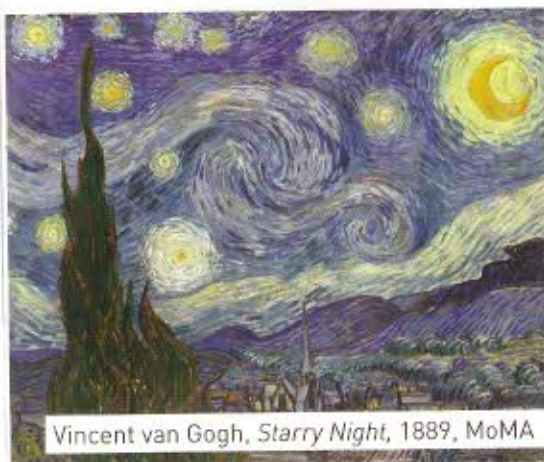
Vincent van Gogh, Starry Night , 1889, MoMA