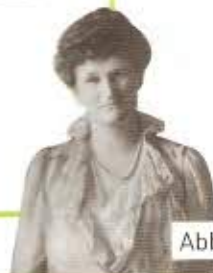
Abby Aldrich Rockefeller